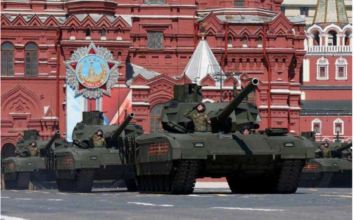
Russian T-14 Armata tanks parade in front of Red Square.