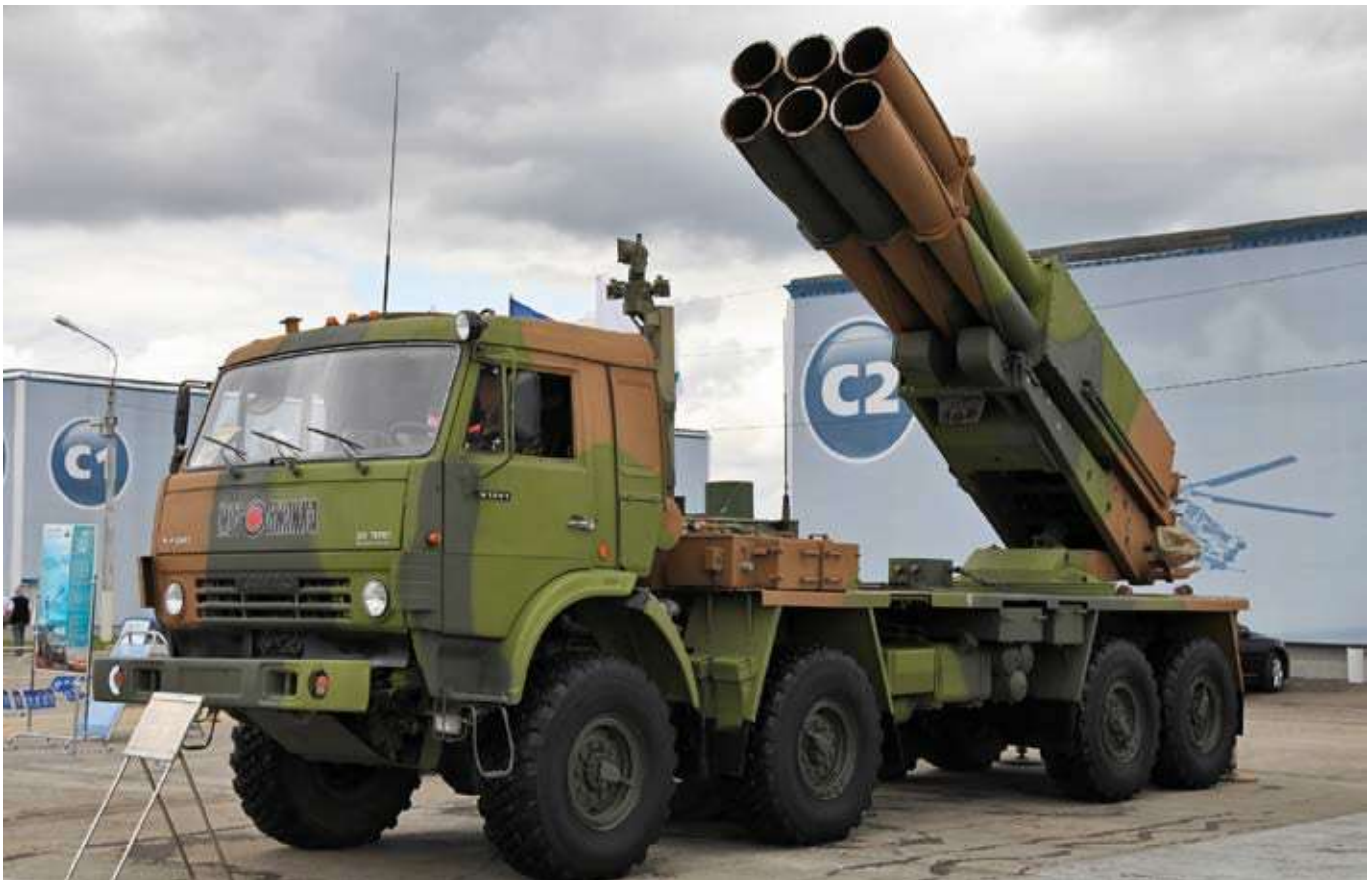
Russian 9A52-4 MLRS.

One legacy of the Yom Kippur War was the wide-spread adoption of reactive armor to defend against ATGMs. Tandem-charge ATGM warheads (features of the Spike, Javelin, and TOW-II missiles) were designed to counter this defense. In Ukraine (and most recently Syria), Russia has taken the next step in this cycle by equipping some of its most advanced main battle tanks with an active protection system against missiles. The results have been compelling. During the battle for Donetsk, for example, Ukrainian anti-tank crews dubbed it the “magic shield,” which inexplicably protected Russian T-90s on the battlefield. 4 The net impact of this system has been to decrease the relative combat power of anti-tank infantry and increase the shock and survivability of Russian heavy armor.