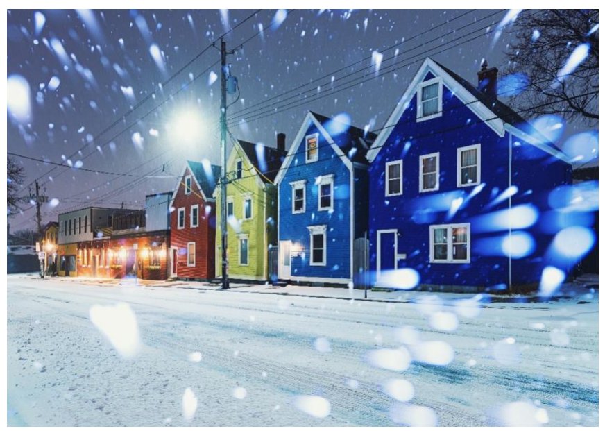
Snowy residential street, Halifax.

<u>Indigenous peoples</u> have lived in Canada since before European settlers and explorers arrived. Halifax, like much of Nova Scotia, is located on the traditional territory of the Mi'kmaq (Meeg-mah) Nations.