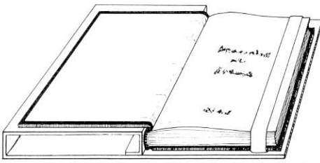
Figure 2. Box support holding front cover.

be joined using a small piece of double-sided tape (3M #415). Take care that the tape does not come into contact with the book. The strips should be wide enough for the size and thickness of the book and should not be fastened too tightly around the pages.