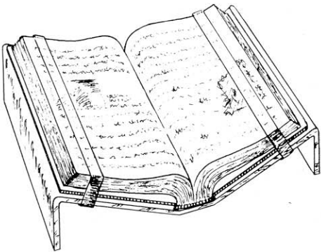
Figure 3. V-shaped support for open books.

Books that are to be displayed open or that do not open easily are better supported by a wide, V-shaped form made of stronger, rigid materials like Plexiglas (acrylic plastic sheet), wood that has been painted and faced with acid-free matboard, or Hi-core (Figure 3).