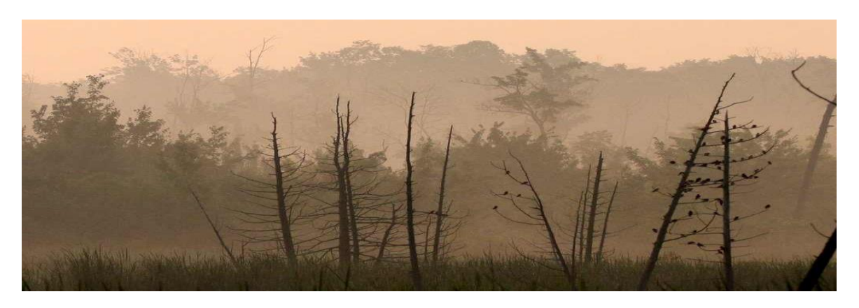
Smog from wildfires in Quebec, 2023

CSC is dedicated to the climate change related commitments set forth in Greening Government Strategy by evaluating energy consumption of institutions and implementing measures to reduce greenhouse gas emissions. Initiatives in this area contribute to the reduction of the severity and frequency of extreme temperatures and precipitation as well as wildfires, heatwaves, flooding and droughts. In addition, reducing GHG emissions will slow biodiversity loss in Canada and the negative health impacts on Canadians.