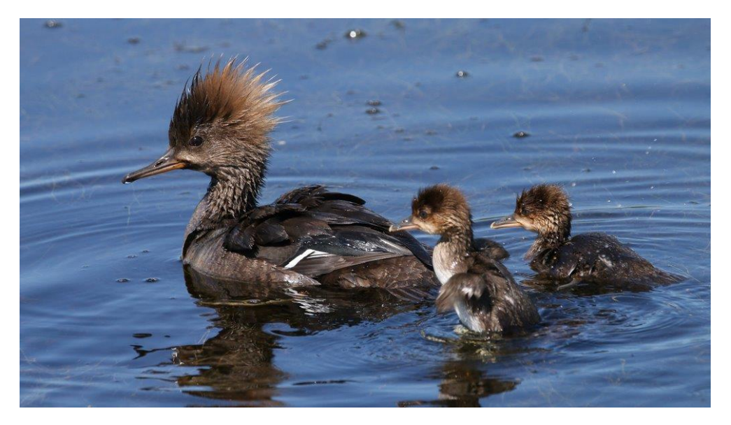
Family of ducks

CSC issues a Policy Bulletin every time a new or revised national policy instrument is promulgated. Its purpose is to introduce the policy change(s) and provide the rational for the change(s). Currently, Policy Bulletins include information under key headings, such as "Why was the policy changed?", "What has changed?" and "How was it developed?". CSC will explore the potential for amending the current Policy Bulletin template to include information around the completion of a SEA. The introduction of such an approach will assist CSC in undertaking reflexive policy development that is continually aligned with environmental legislation and the department's Sustainable Development Strategy.