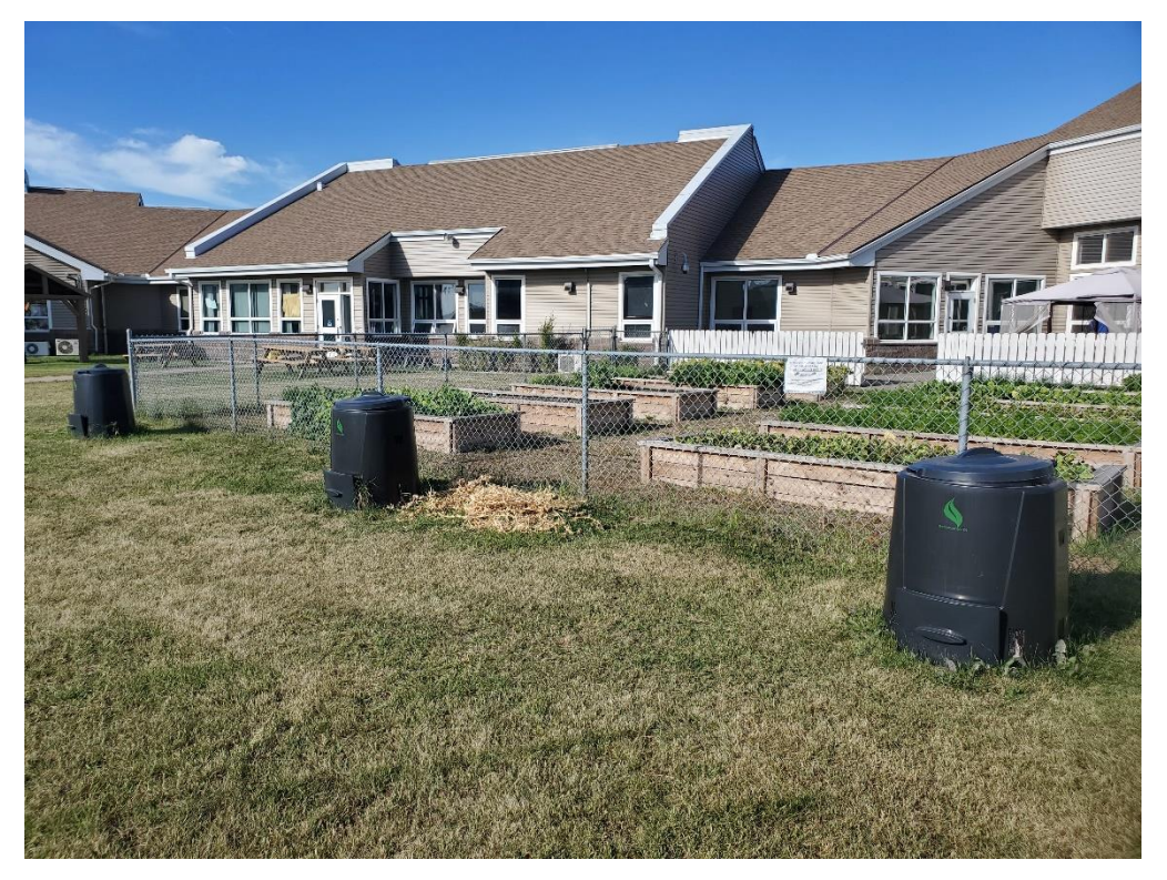
Edmonton Institution for Women, Alberta

Note: CSC performance indicators and targets have an end date of March 31 of the year indicated.