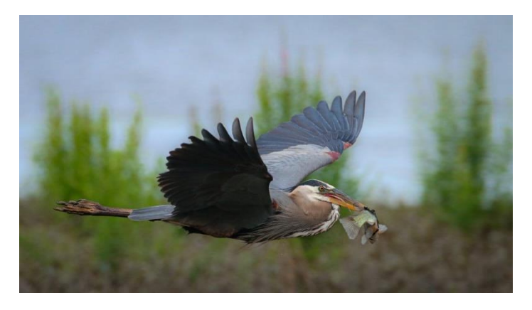
Heron with a fish

Hence, CSC will continue to make every effort to further demonstrate strong departmental leadership by managing its operations in an ecologically sound manner.