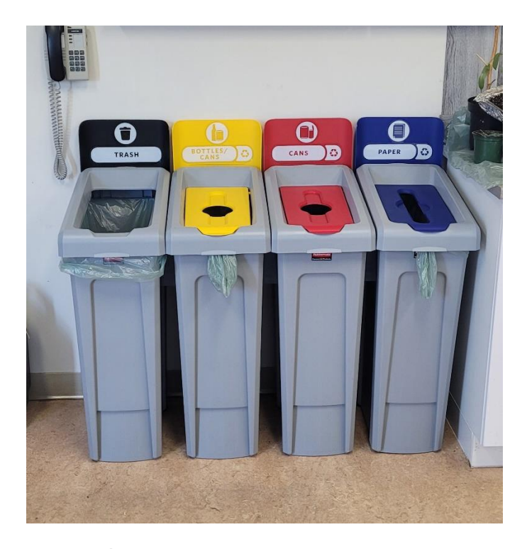
Institutional Waste Sorting Station