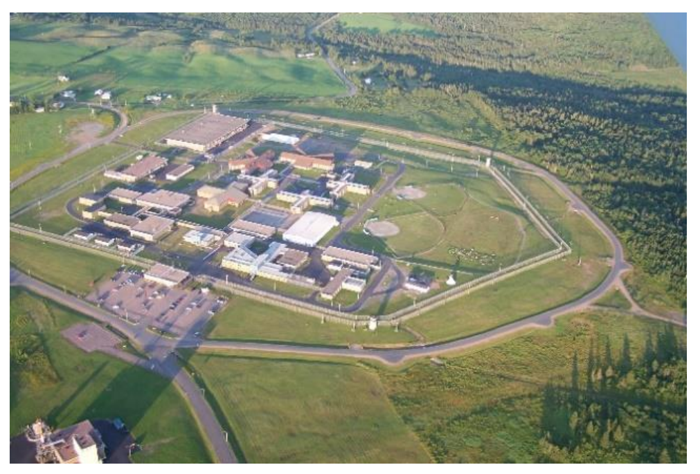
Springhill Institution aerial view, Nova Scotia

Please find more information on the FSDS public consultation and its results in the FSDS Consultation Report.