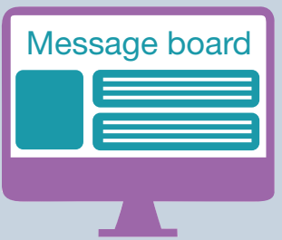
Group discussion board