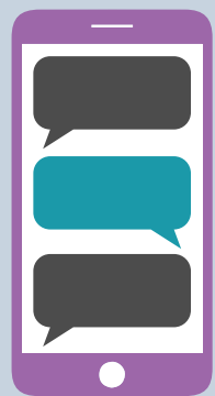
One-on-one text and chat mobile app

You have the flexibility to change from one format to another at any time