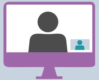
One-on-one virtual meeting platform