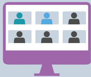
Group virtual meeting platform