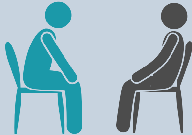
One-on-one in person