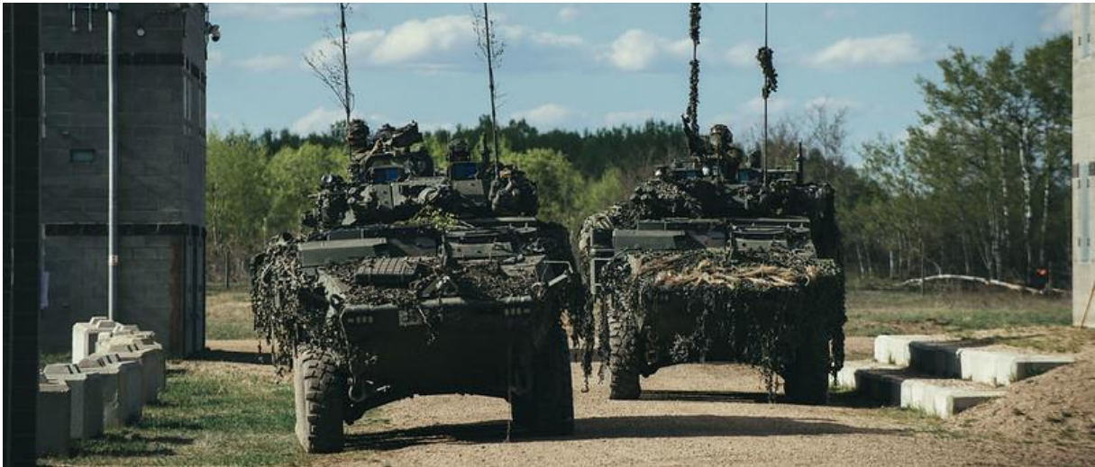
Two Canadian Armed Forces Light Armoured Vehicles (LAV 6) provide support to infantry troops in the area during a simulated attack in the Rocky Ford Urban Training Area, during Exercise MAPLE RESOLVE in Wainwright, Alberta on May 15, 2022.