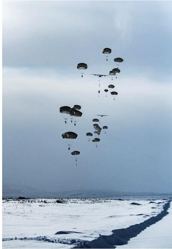
Members of the United States Army Alaska and members of 3 rd Battalion, Royal 22 e Régiment, Canadian Army parachute to the ground after jumping out of C-130 and C-17 aircrafts over the training area of Fort Greely, Alaska, United States, during Exercise Joint Pacific Multinational Readiness Center 22-02 on March 11, 2022.

to operate in the Arctic and adapt to a changed security environment. Arctic communities are the most present and most enduring expression of Canada's sovereignty; therefore, early, ongoing, and meaningful engagement or consultation with Northern provincial, territorial and Indigenous Governments on military activities in the Arctic is critical.