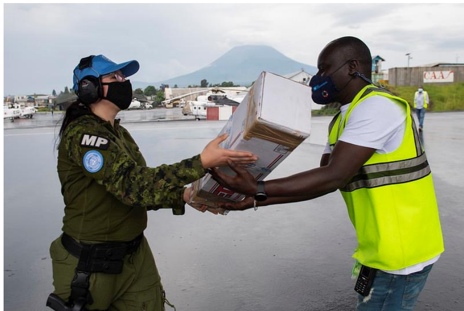
A member of the Military Police deployed on Operation PRESENCE Uganda, Tactical Air Detachment Goma, helps the crew offload a CC-130J Hercules at Goma International Airport, Democratic Republic of Congo on November 22, 2021.