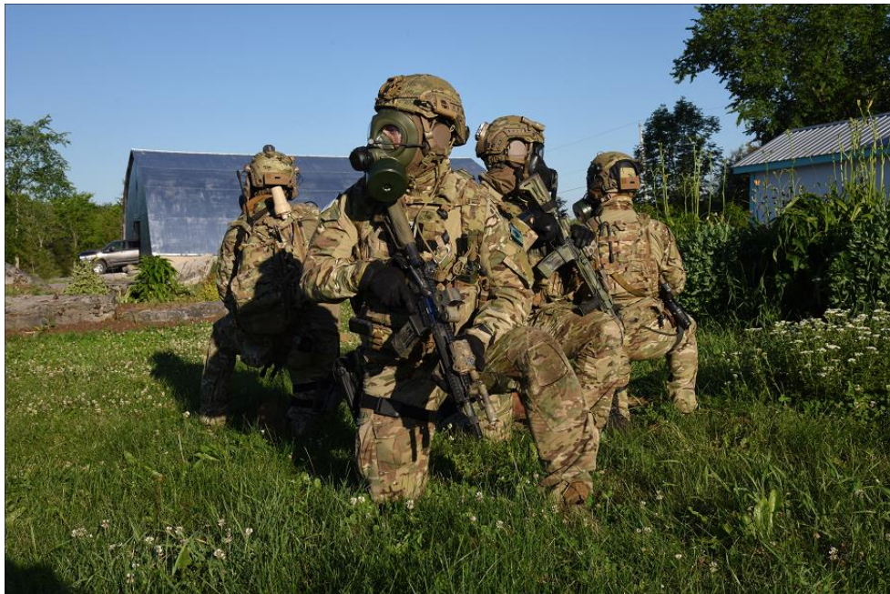
Members of Canadian Special Operations Forces Command conduct training in Ontario, June 2022.