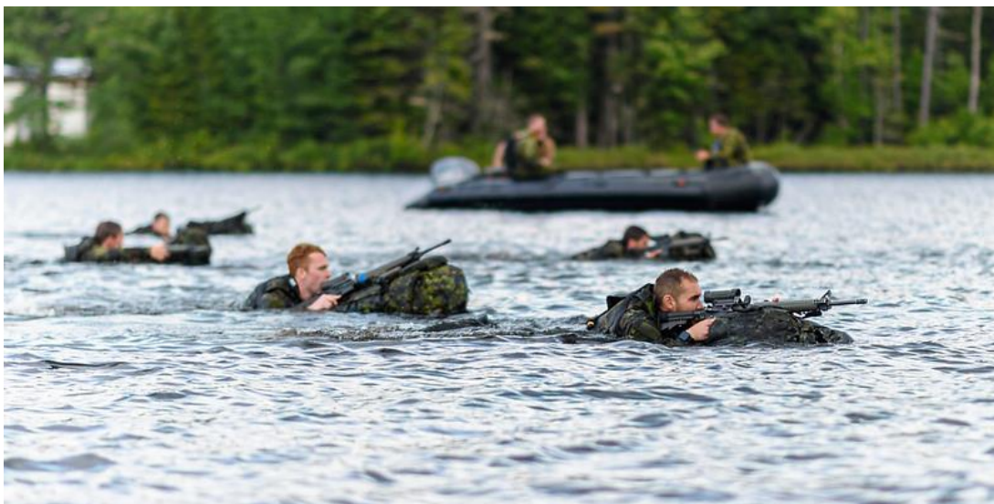
Members of the 3 rd Battalion, Royal 22 e Régiment, swim towards the shore with their weapons aimed at a simulated enemy, on Lac Hayes in the training areas of 2 nd Canadian Division Support Base in Québec on July 19, 2022.