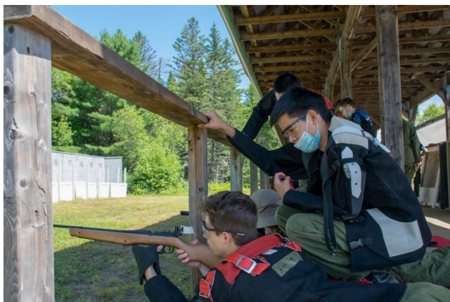
A senior cadet coaches a junior cadet at the Valcartier Cadet Training Centre in August, 2022.

The Defence Team, in specific reference to the Canadian Army, will deliver an Indigenous youth leadership program, Eagle's Nest. The Canadian Army will also support Junior Canadian Ranger Enhanced Training Sessions such as Camp Loon.