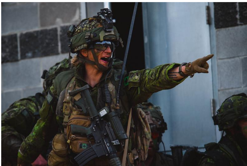
A member of the 2 nd Battalion, The Royal Canadian Regiment shouts orders to troops during a simulated attack as part of Exercise MAPLE RESOLVE in Wainwright, Alberta on May 21, 2022.