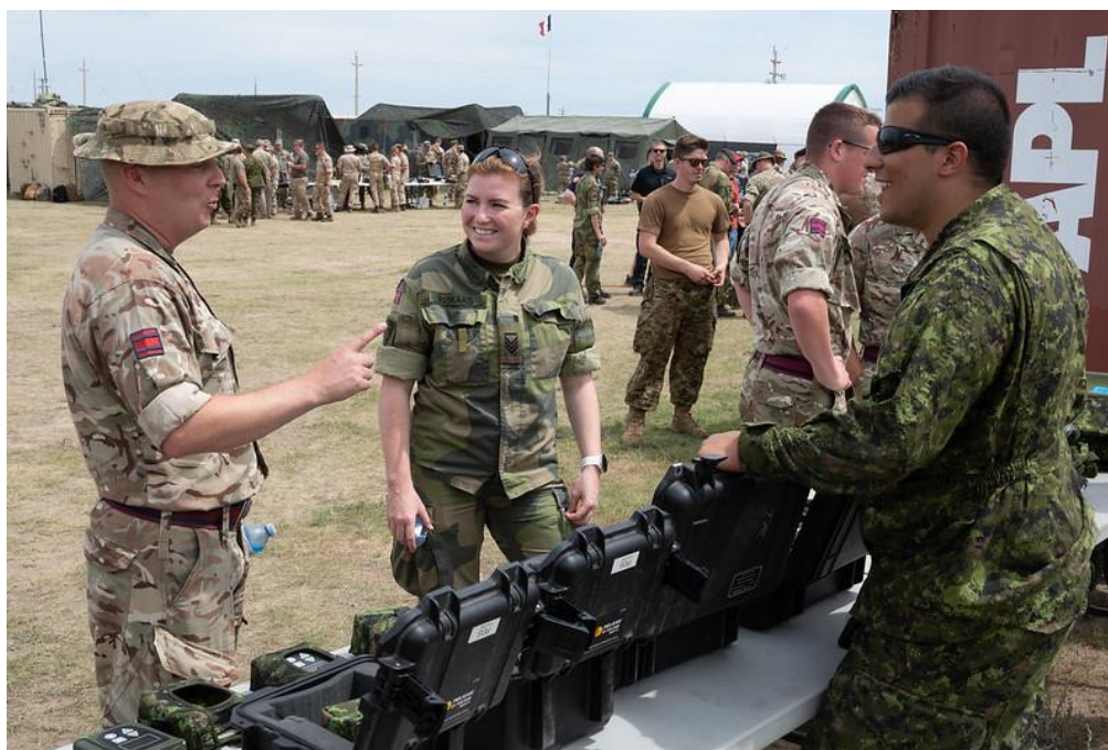
Canadian Army and international personnel conduct chemical, biological, radiological, and nuclear response training as part of Exercise PRECISE RESPONSE 2022, July 2022 at CFB Suffield, Alberta.