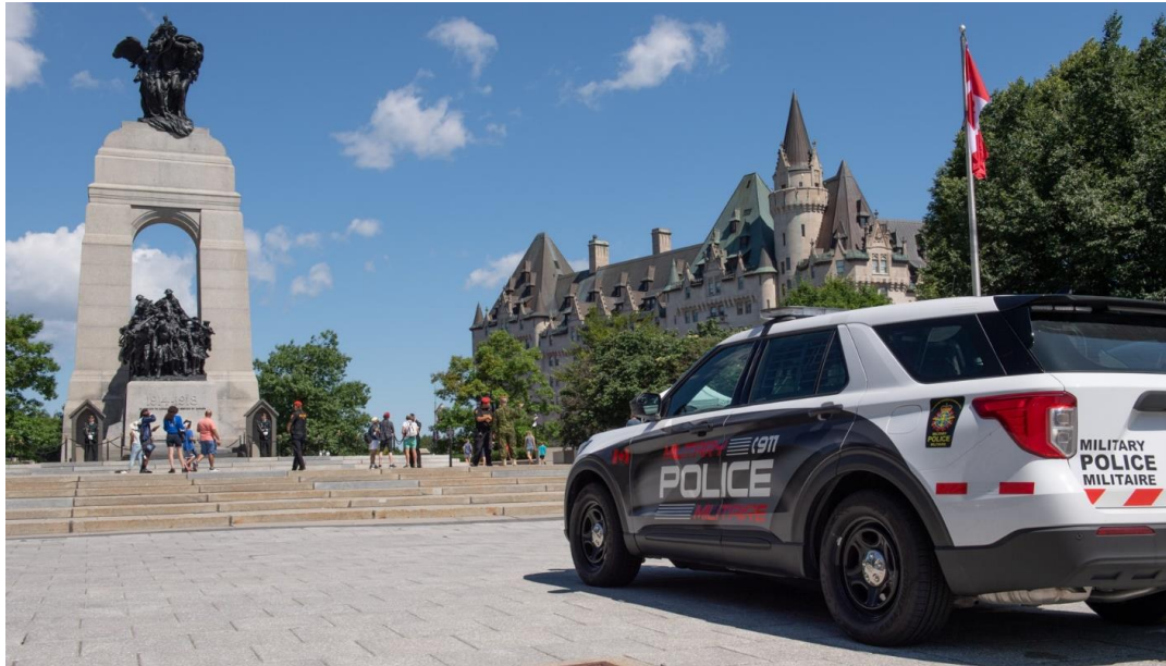
Military Police provide protection to CAF members guarding the Tomb of the Unknown Soldier at the National War Memorial in Ottawa, Ontario, during Summer 2022.

The DSP implementation will focus on positive management of strategic security risks and their associated risk treatment plans, to better align with enterprise risk management. DND/CAF will also adapt and modernize the DND Security Program, capitalizing on lessons learned and fundamental changes caused by the COVID-19 pandemic. It will continue to implement the updated Business Continuity Management Program by the deliberate and federated conduct of business impact analyses at the departmental level, using automated tools and proactive governance to effectively manage critical services.