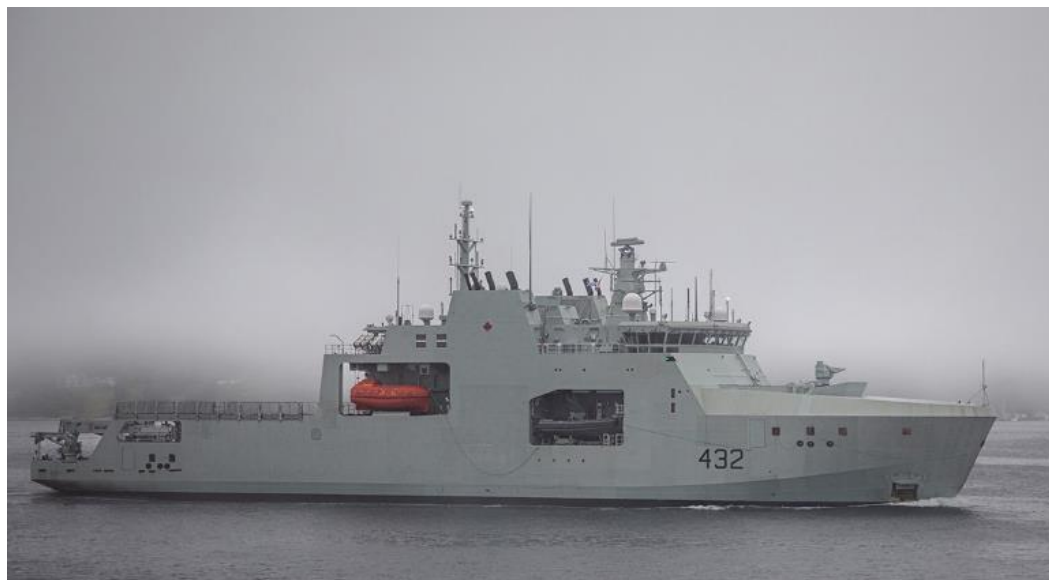
The third Arctic and Patrol Ship, HMCS Max Bernays , returning to port after completing sea trials in Halifax, Nova Scotia.

In FY 2023-24, all remaining Victoria-class modernization projects are scheduled to enter the definition phase. Requests for proposals will be released for both the Flank Array Modernization Project and the Periscope Modernization Project. The Galley Improvement Project, the Flank Array Modernization Project and the Periscope Modernization Project are scheduled to enter the implementation phase. Installation of habitability and quality of life upgrades will commence on HMCS Victoria .