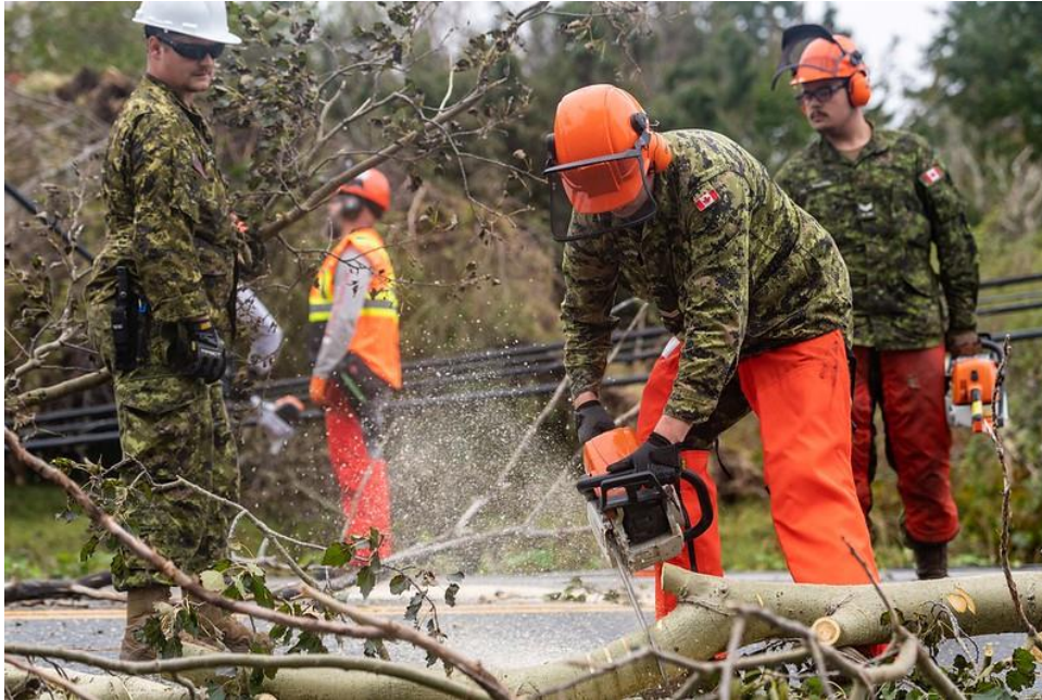
Members of the CAF respond to the province of Nova Scotia's request for assistance with relief efforts during Operation LENTUS, xxiii in the aftermath of Hurricane Fiona that took place on September 24, 2022.