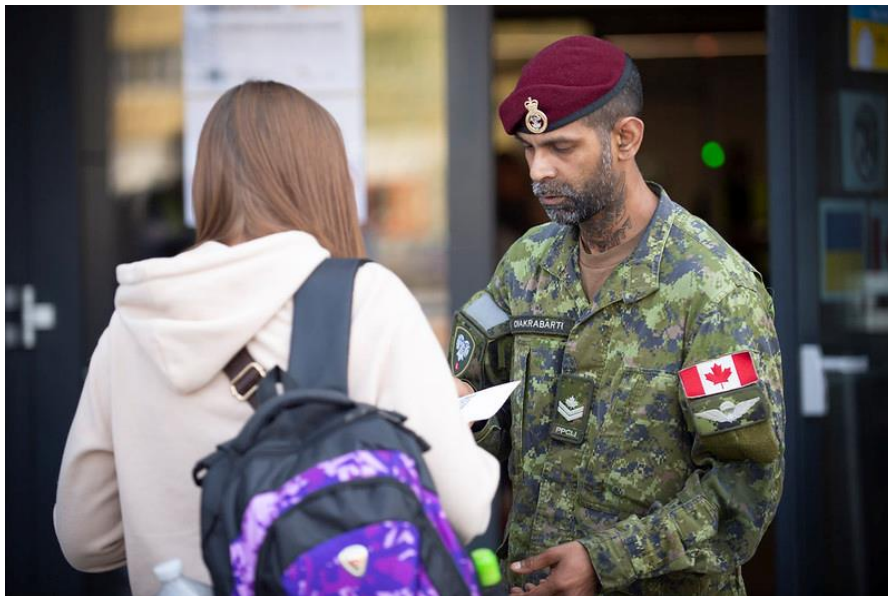
A member of Task Force Poland provides humanitarian assistance at a reception centre in Warsaw, Poland on April 28, 2022.