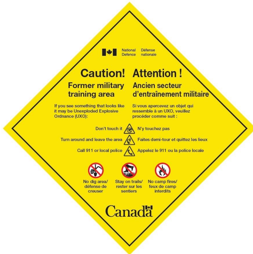
Figure 2 - UXO Safety Sign