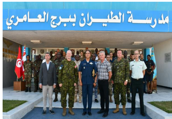
Exercise Planning Process Course, Tunisia