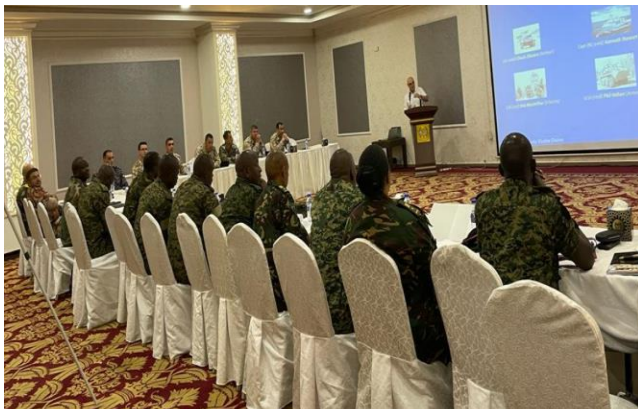
Senior Officer Security Studies Course, Jordan