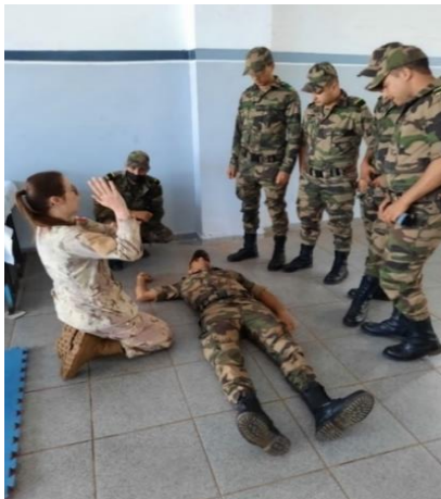
Combat Medical Training, Morocco