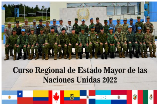
United Nations Staff Officer Course, Mexico