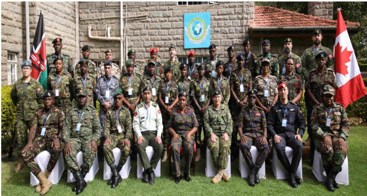
International Law of Armed Conflict Course, Kenya, March 2023

The GES provides guidance on geographic areas of focus for defence diplomacy and highlights the importance of capacity building as a tool for international engagement. The MTCP supports the strategic objectives and priorities it lays out.