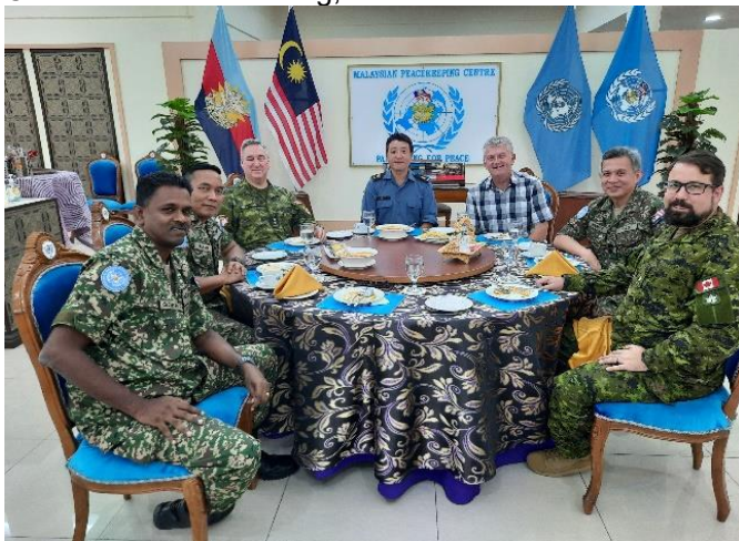
Integration of Women and Gender Perspectives in the Armed Forces Workshop, Malaysia