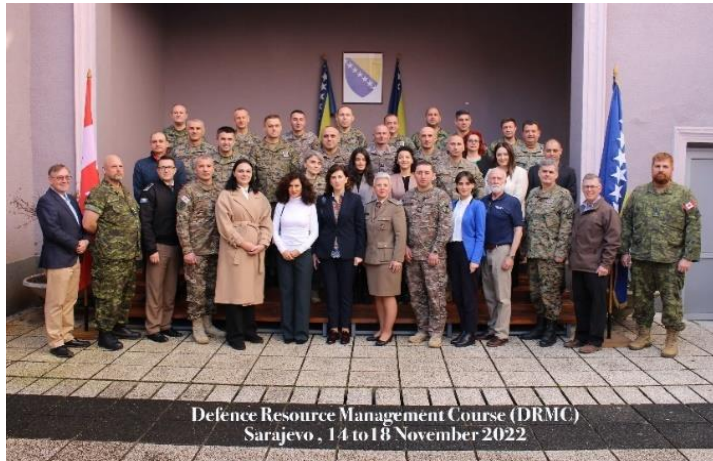
Defence Resource Management Course (DRMC) Sarajevo, 14 to 18 November 2022