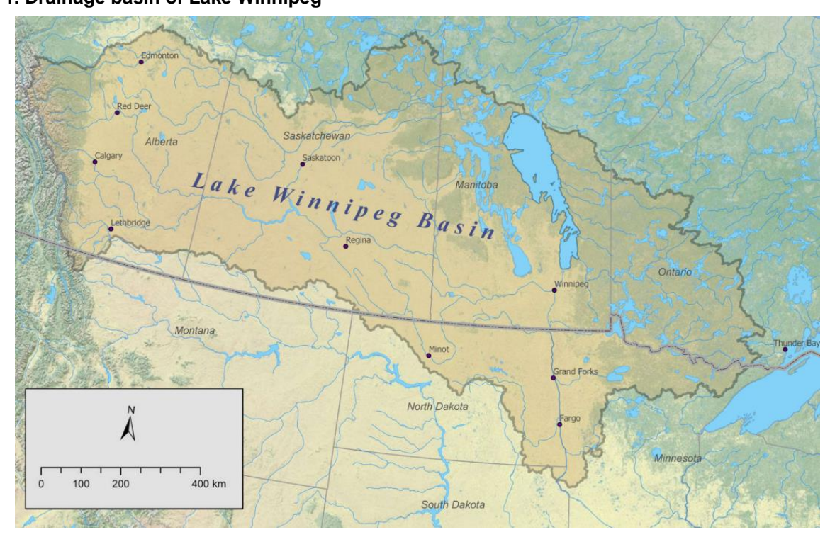
Figure 1. Drainage basin of Lake Winnipeg

Projects completed between 2010 and 2023 have prevented an estimated 390 445 kilograms of phosphorus from reaching Lake Winnipeg