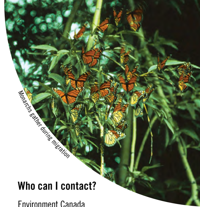
Monarchs gather during migration