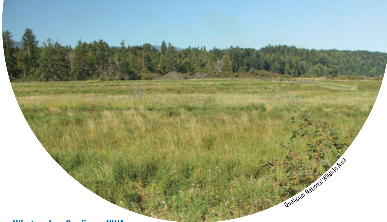
Qualicum National Wildlife Area