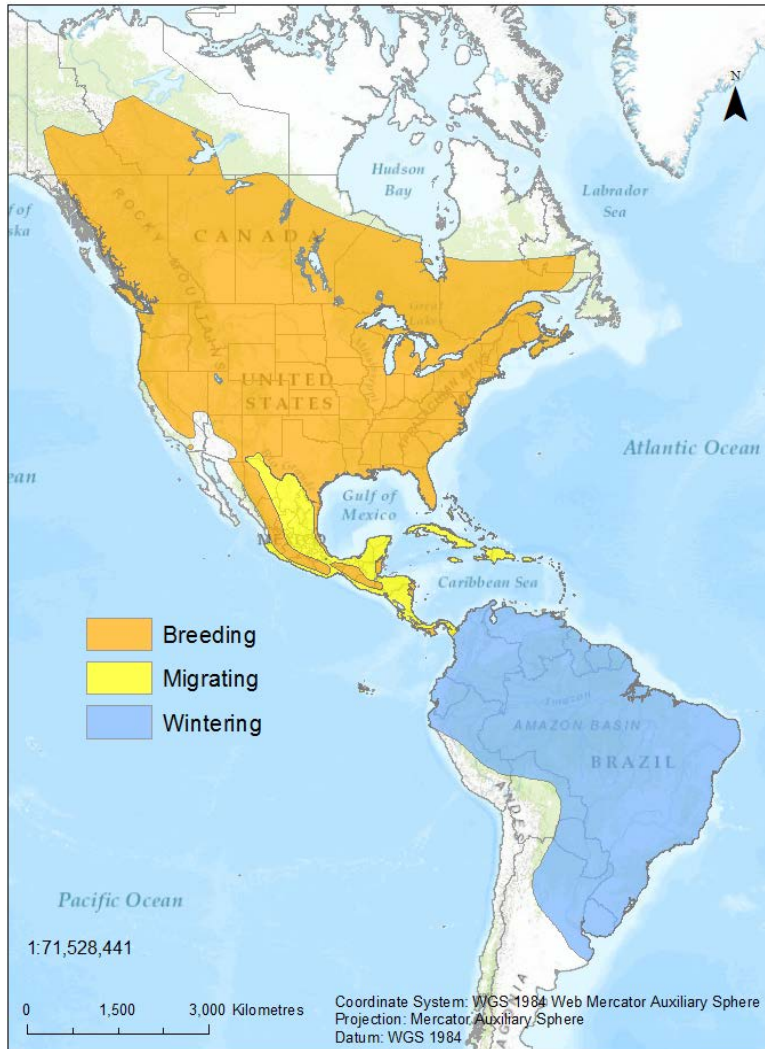
Figure 1. Common Nighthawk distribution map (adapted from BirdLife International and NatureServe (2014), using data from Haché et al. (2014), and eBird (2014)).

Ten percent of the global population of Common Nighthawks is estimated to breed in Canada (Rich et al. 2004) and the species' population in Canada, based on Breeding Bird Survey results, was estimated in COSEWIC (2007) as 400,000 adults and underwent an 80% decline between 1968 and 2005 (average: -4.2% per year; Downes et al. 2005). More recently, the Partners in Flight Population Estimates database was updated and now provides the most comprehensive information on North American landbirds. The Canadian population of Common Nighthawks is now estimated to be 900,000 adults (Partners in Flight Science Committee 2013). This does not represent an actual increase in the population but rather is the result of newer analytical techniques and a refined detection distance used to estimate density.