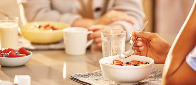
Be mindful of your eating habits

Healthy eating is more than the foods you eat