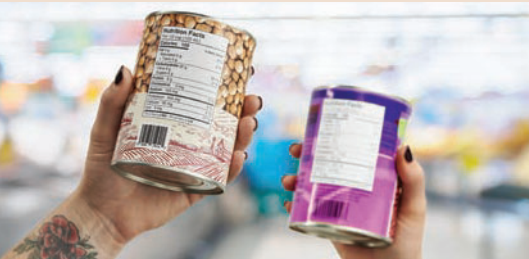
Use food labels