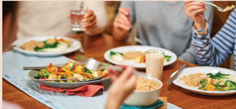
Eat meals with others