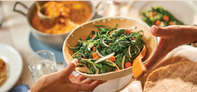
Enjoy your food