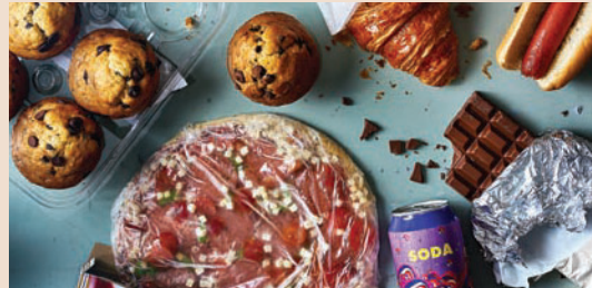
Limit foods high in sodium, sugars or saturated fat