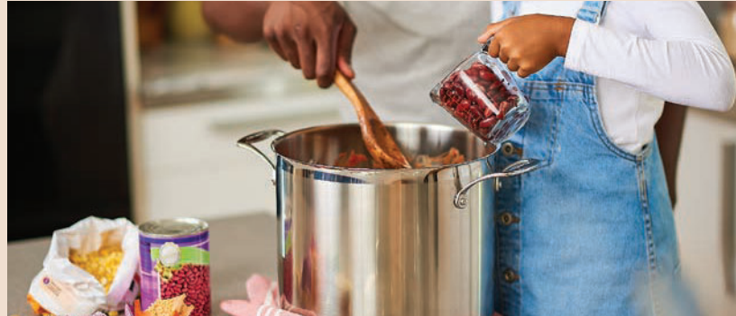
Cook more often