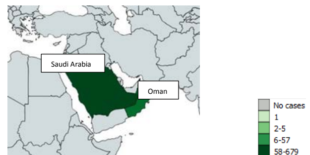
Figure 4. Spatial distribution of human cases of MERS-CoV, January 1, 2019 to February 28, 2019.

Note: Map was prepared by the Centre for Immunization and Respiratory Infectious Diseases (CIRID) using data from the latest WHO Disease Outbreak News and Saudi Arabia's Ministry of Health. This map reflects data available through these risk assessments as of February 28, 2019.