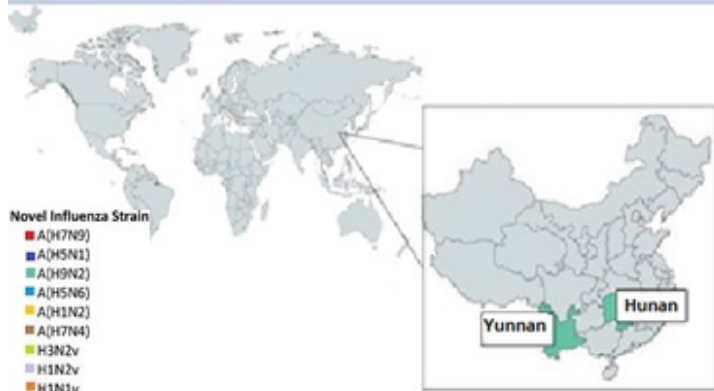
Figure 2. Spatial distribution of human cases of avian and swine influenza reported globally in February 2019.

Note: Map was prepared by the Centre for Immunization and Respiratory Infectious Diseases (CIRID) using data from the latest WHO Monthly Influenza at the Human-Animal Interface Risk Assessment. This map reflects data available through these risk assessments as of February 28, 2019.