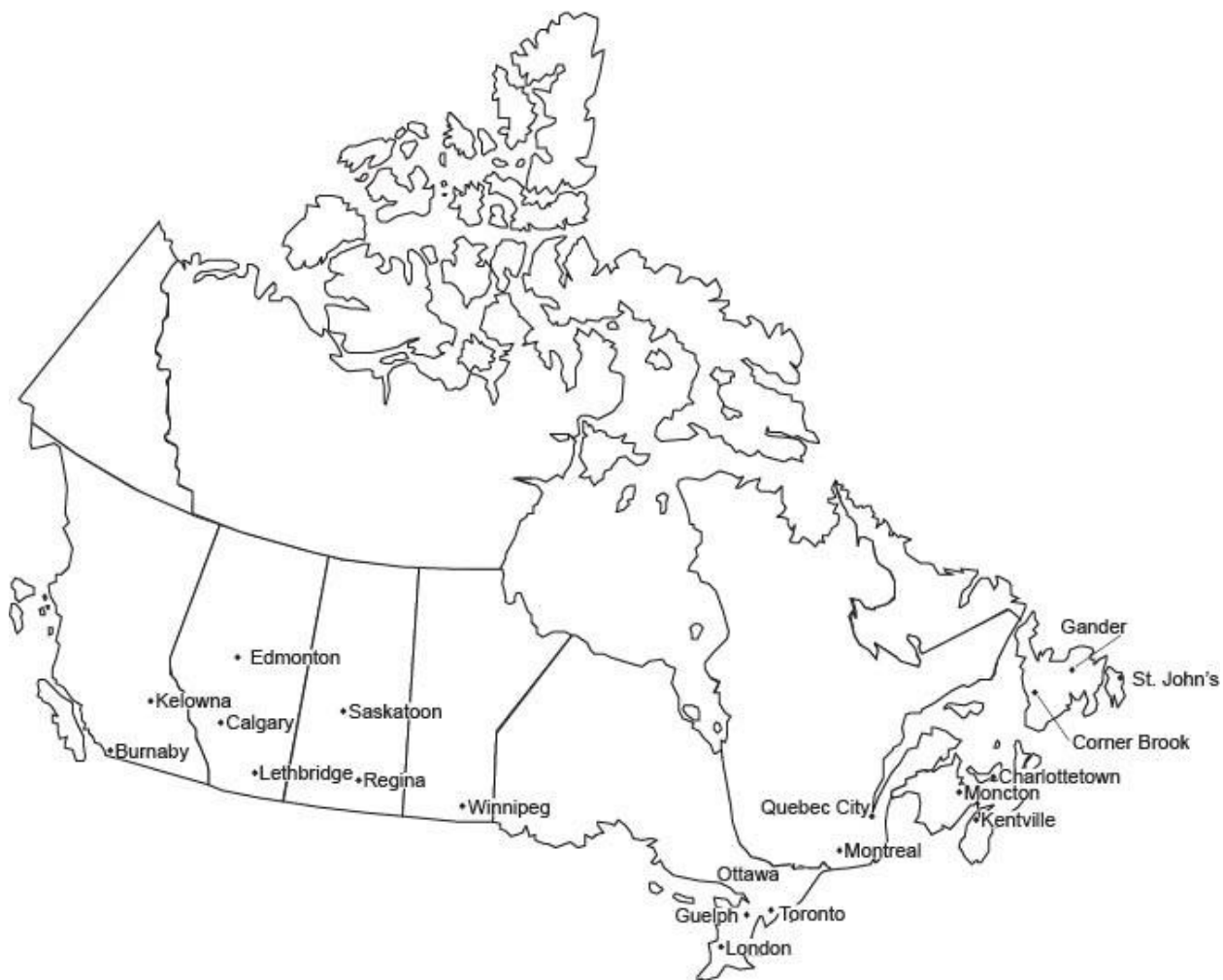
Figure 1. Map of Regional Offices and Headquarters (Ottawa)