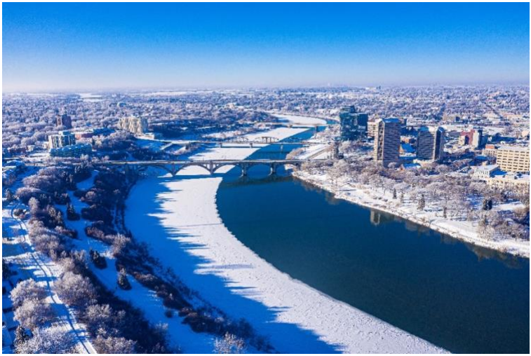
An aerial view of Saskatoon in the winter.

<u>Indigenous peoples</u> have lived in Canada since before European settlers and explorers arrived. Saskatoon is located on <u>Treaty 6 Territory</u> (<u>Cree, Dakota, Nakota, Saulteaux</u>) and the <u>Métis Homeland</u>.