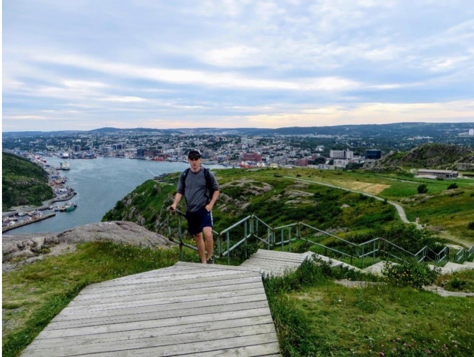
A person walking up signal hill towards Cabot Tower with St. John's harbour in the background.