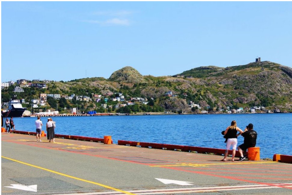
People standing on a pier at St. John's Harbour, taking pictures of Signal Hill.

Indigenous peoples have lived in Canada since before European settlers and explorers arrived. St. John's, like the rest of Newfoundland and Labrador, is located on the unceded and traditional territory of the Beothuk, the Mi'kmaq (Meeg-mah), and the ancestral lands of the Innu and the Inuit Nations.