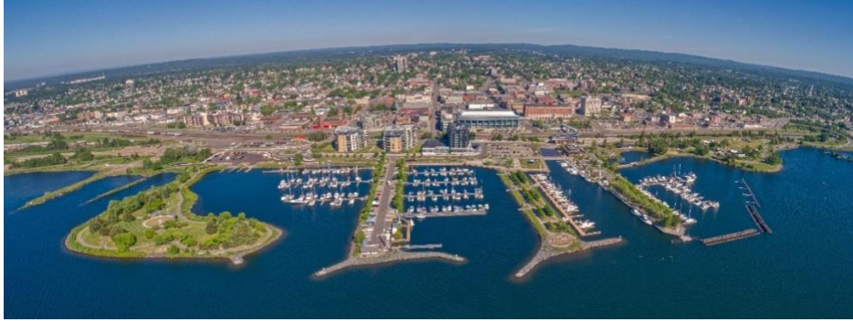
Aerial view of Thunder Bay, Ontario on Lake Superior in summer.