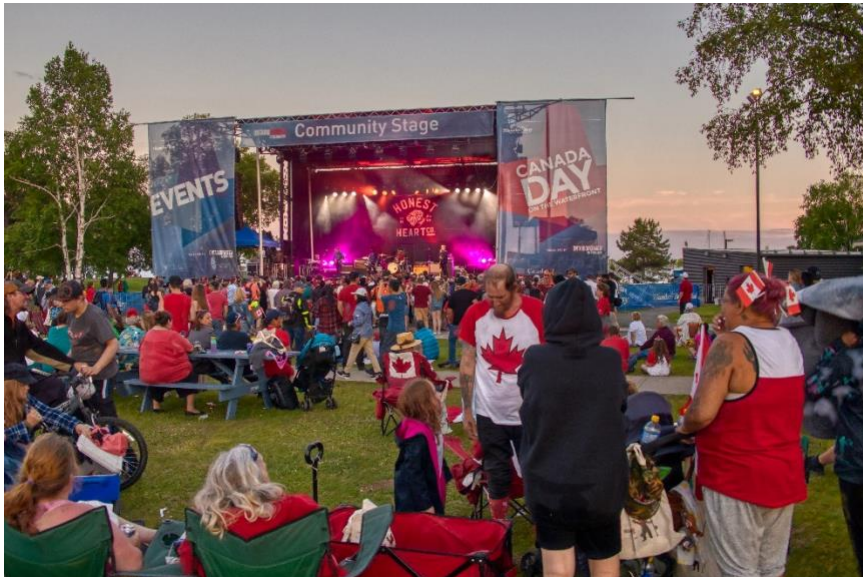
Canada Day, cultural festival.

Indigenous peoples have lived in Canada since before European settlers and explorers arrived. Thunder Bay is located on the traditional lands of the Anishinaabe and Métis Peoples, and Fort William First Nation, signatory of the Robinson Superior Treaty.