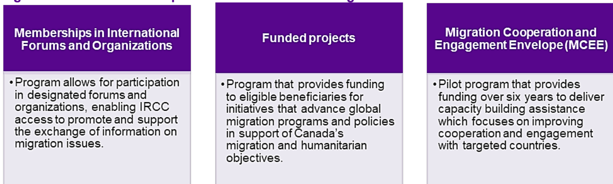
Figure 1: IMCBP Components Administered through the IMCBP as of FY 2020–2021

This evaluation focused on the MIFO component of the IMCBP and a separate evaluation examined the IMCBP-Funded Projects.