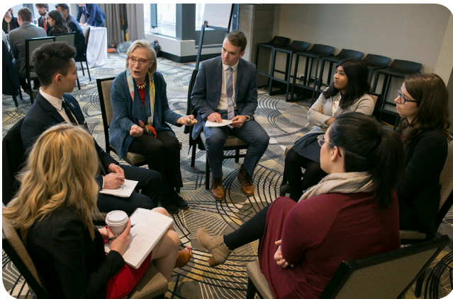
PMYC members discuss the different facets of reconciliation with Minister Bennett