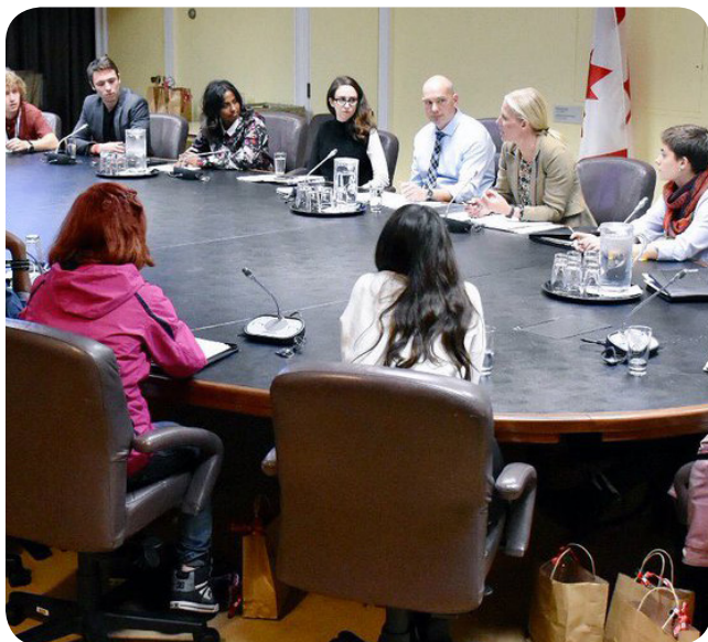
PMYC members discuss climate action with Minister of Environment & Climate Change