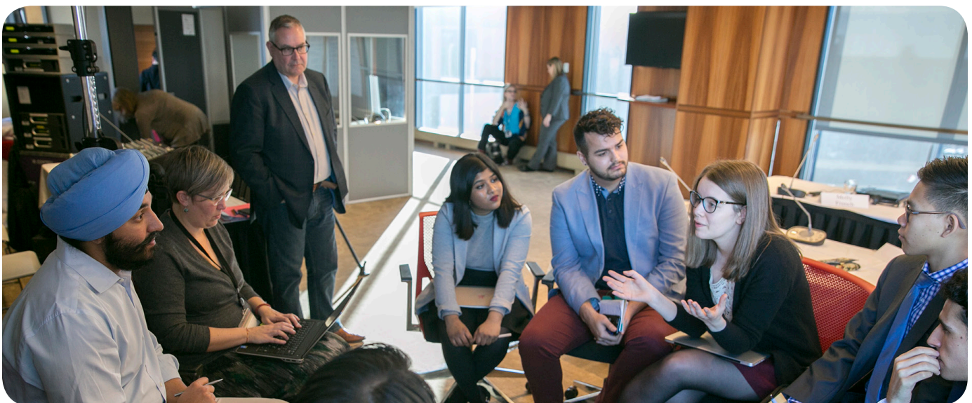
PMYC members share their views with Minister Bains on innovation and ways to encourage youth and women to enter STEM (science, tech, engineering, math) fields