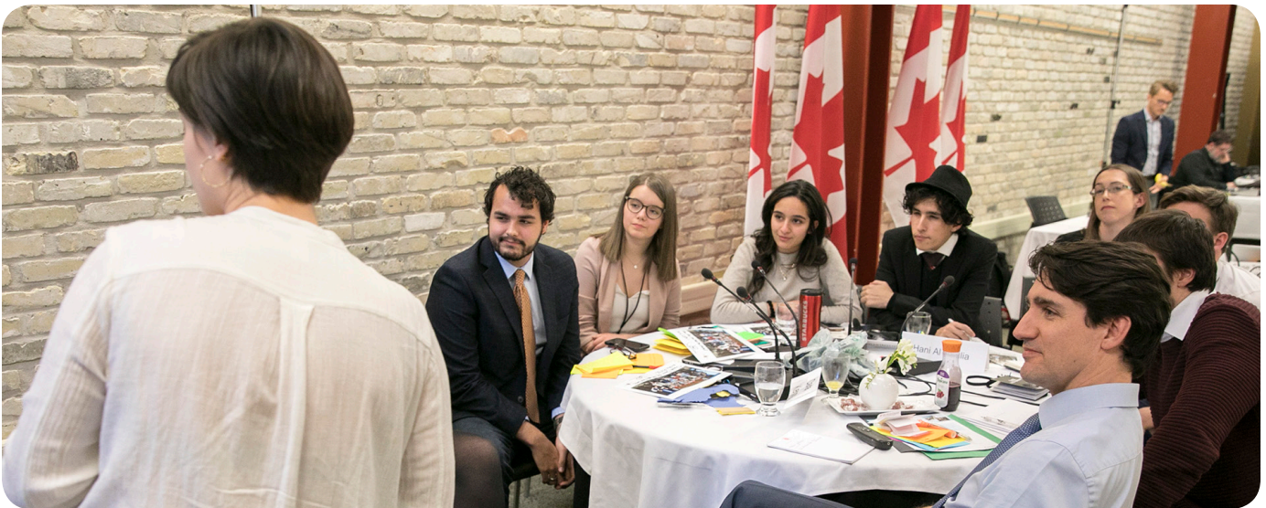
PMYC members provide additional input on Canada's gender-based violence strategy, on sexual violence on campuses and on the Survey of Safety in Public and Private Spaces.

Through their work, PMYC members have highlighted issues such as street harassment and the living conditions of neighbourhoods with high newcomer populations. These inputs shape Canada's efforts to build a more inclusive society, where all Canadians have equal access to services and opportunities.