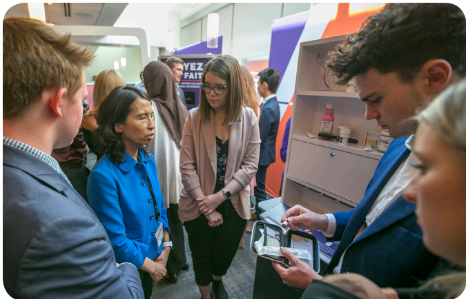
In a special session on Canada's response to the opioid crisis, PMYC members met with Dr. Theresa Tam (Chief Public Health Officer of Canada) and parents with lived experience to talk about raising awareness, reducing stigma and finding solutions.

PMYC members continued to advance work on a youth policy for Canada, where they analyzed data from cross-Canada consultations launched in February 2018.