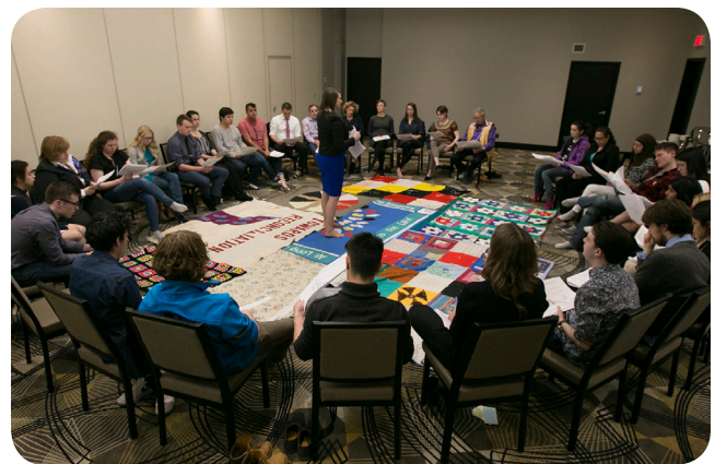
The PMYC participates in the KAIROS Blanket Exercise