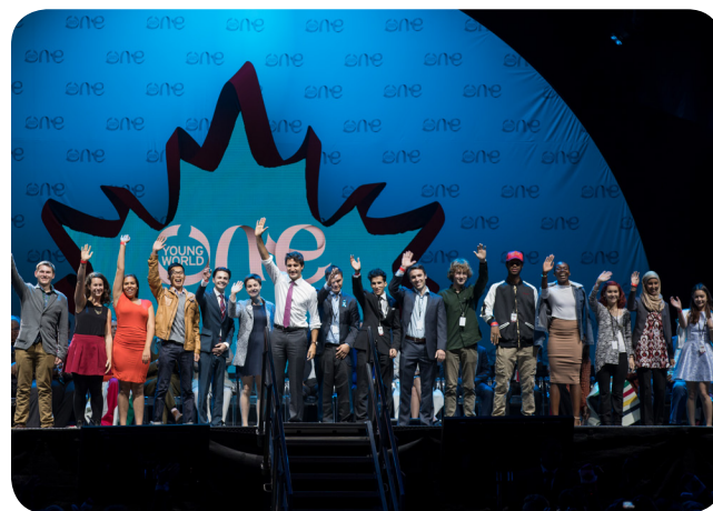
The Prime Minister introduces the first members of the PMYC to over 1,000 ambassadors and delegates at the One Young World Summit