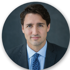
Right Honourable Justin Trudeau, Prime Minister of Canada and Minister of Youth

Through this report, I want to show to Canadians how the Youth Council has impacted and shaped the government's work on priority issues, and how this new advisory body is changing the way we seek and incorporate youth perspectives into policy. Together, we are building a better Canada.