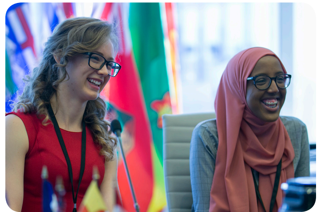
New members of the PMYC have their first meeting