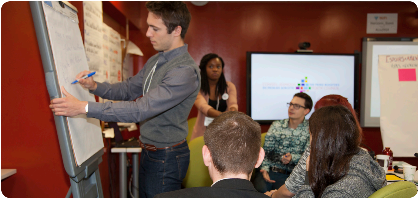
PMYC members' ideas and contributions from a mind-mapping session on youth service help lay the foundation for the launch of the Canada Service Corps in January 2018.

Discussions on climate action fed into the National Youth Summit on Climate Change on November 23, 2016, with over 100 youth from the Ottawa-Gatineau region participating, and more joining the conversation online. The summit reached well over 500,000 Canadians on social media through #YouthClimateAction .