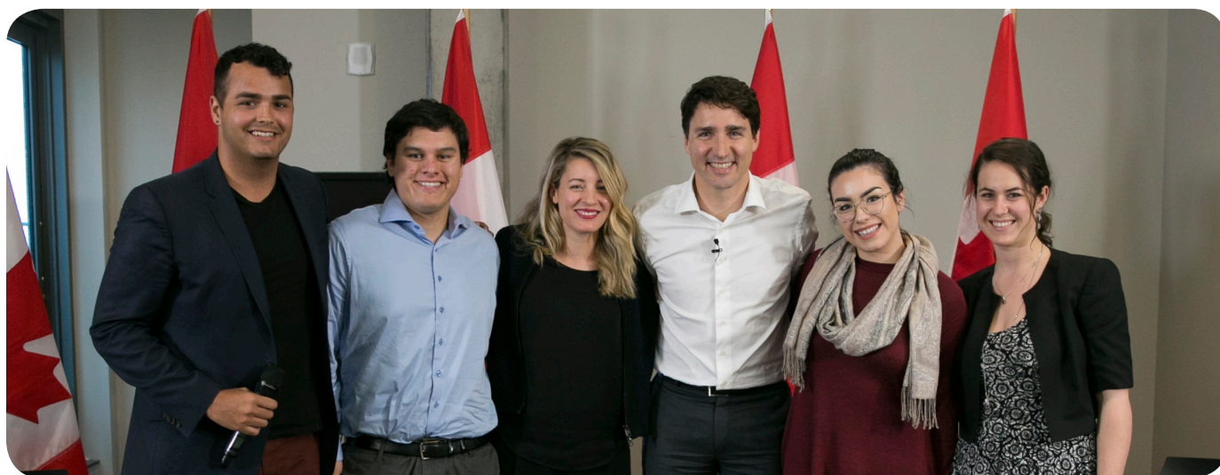
As part of the meeting in Montreal, PMYC members participate in a Facebook Live discussion on reconciliation, together with the Prime Minister and Minister of Canadian Heritage. The session has over 230,000 views and over 3,000 comments.

On May 30, 2018, Bill C-262 (An Act to ensure the laws of Canada are in harmony with the United Nations Declaration on the Rights of Indigenous Peoples) passed the Third Reading in the House of Commons with unanimous support from the government.