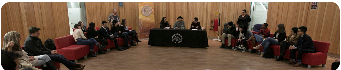
PMYC members meet with local youth leaders at the Ma Mawi Wi Chi Itata Centre