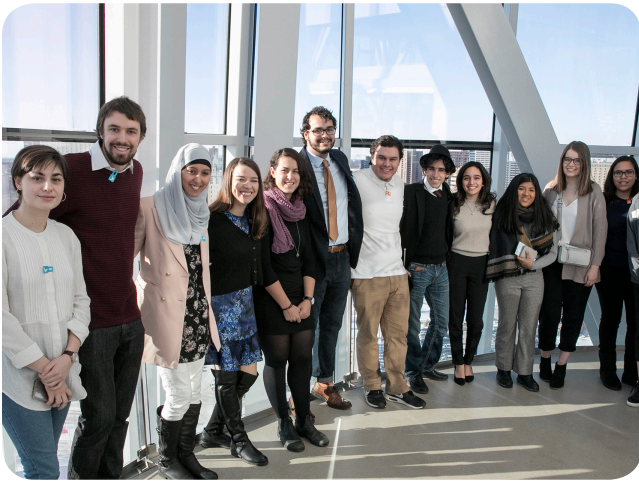
PMYC members tour the Canadian Museum for Human Rights

PMYC members continued to share their perspectives on diversity and inclusion, particularly related to gender equality, supporting immigrants and refugees, and combating racism.