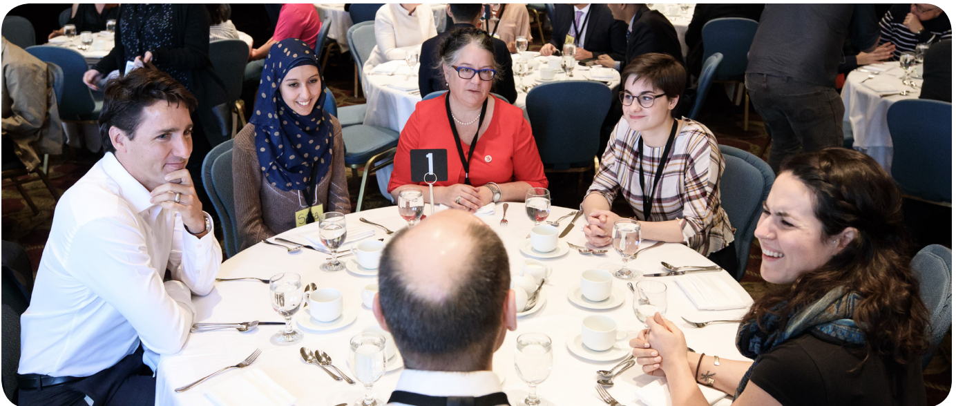
At a networking session with the Prime Minister and Cabinet, PMYC members discuss the state of official languages in Canada

The Expert Panel on Youth Employment reflected Youth Council input in its report, 13 Ways to Modernize Youth Employment in Canada . The report includes a suite of recommendations on strategies to better equip young people to join the workforce, how to support more youth entrepreneurship and ways to create safe and equitable workspaces