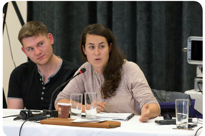
PMYC members present to the Prime Minister their preliminary findings on priority areas of focus for a youth policy for Canada.