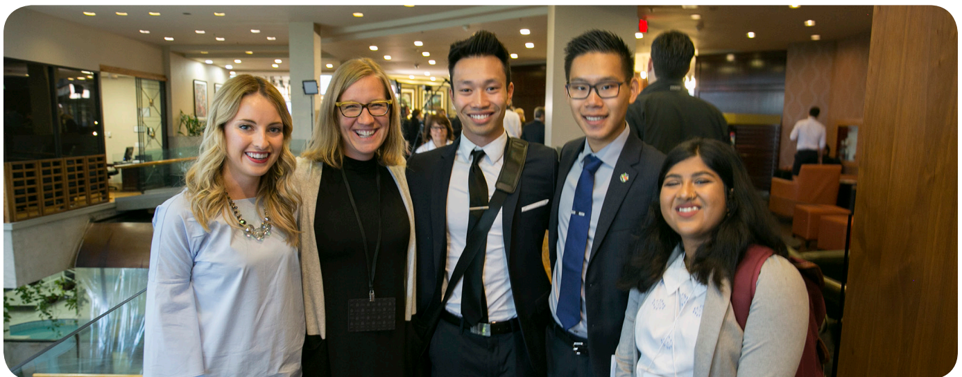
PMYC members discuss issues with Ministers at a networking session as part of the Cabinet Retreat.