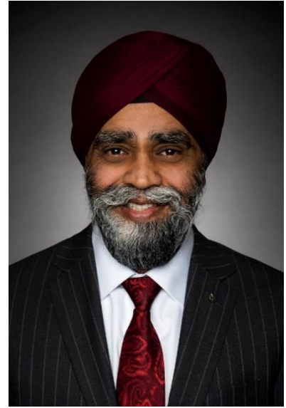
The Honourable Harjit S. Sajjan Minister of International Development and Minister Responsible for the Pacific Economic Development Agency of Canada

I welcome you to read this plan to learn more about how PacifiCan will become an even stronger partner for British Columbians.