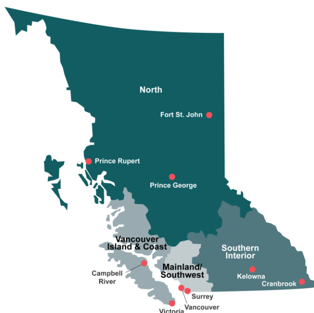
Figure 1: Map of PacifiCan regions and offices

Approximately 40% of British Columbians live in communities outside of the Lower Mainland. In 2022-23, PacifiCan opened seven new offices, in Campbell River, Cranbrook, Fort St. John, Kelowna, Prince George, Prince Rupert and Victoria. These new offices will help British Columbians across the province access PacifiCan staff and resources to develop strong economic strategies. PacifiCan's greater on-the-ground presence across the province will deepen connections with communities and businesses, and ensure that the agency is responsive to local needs.