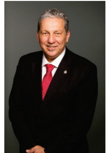
The Honourable Daniel Vandal Minister of Northern Affairs, Minister responsible for Prairies Economic Development Canada, and Minister responsible for the Canadian Northern Economic Development Agency

In these pages, you will find more insight about the priorities of PrairiesCan, and our commitment to deliver on them in partnership with the people of the Prairies.