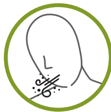
USHTASHTAM U AUEN